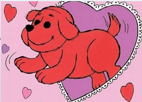
Clifford the Big Red Dog illustrated by Norman Bridwell!

Remember to be kind and respectful with your messages!