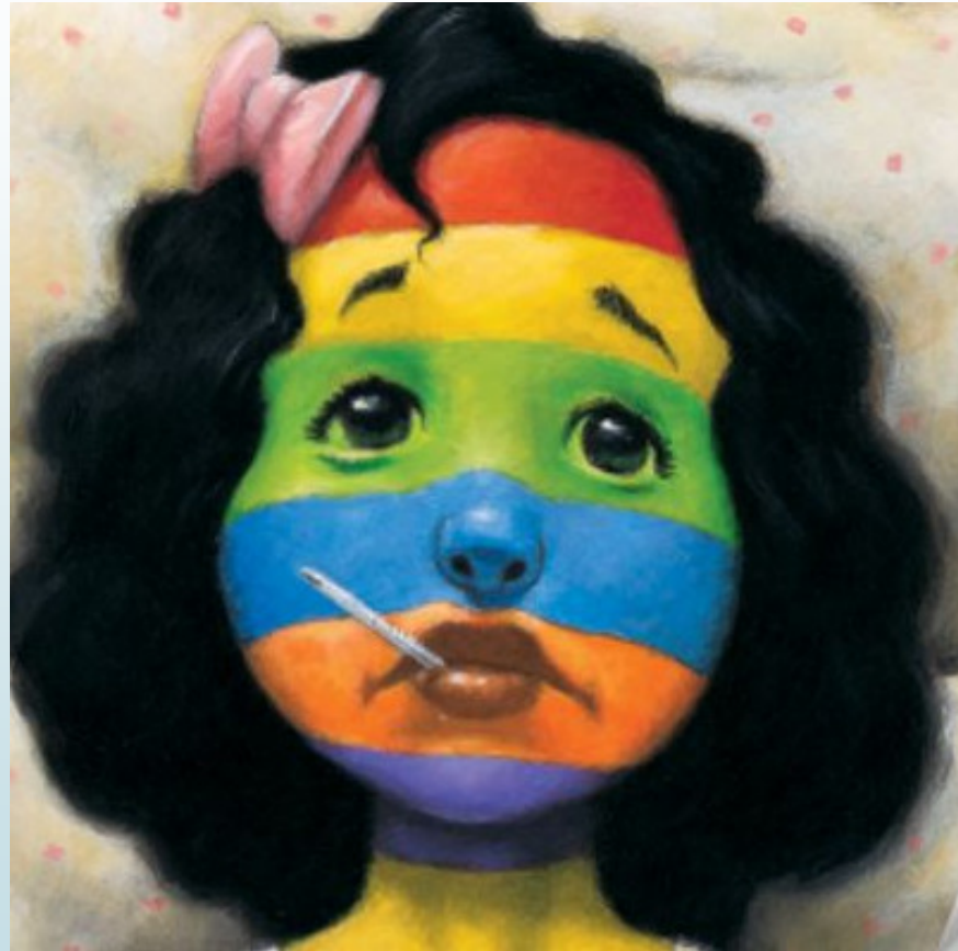
~ A Bad Case of Stripes illustrated by David Shannon