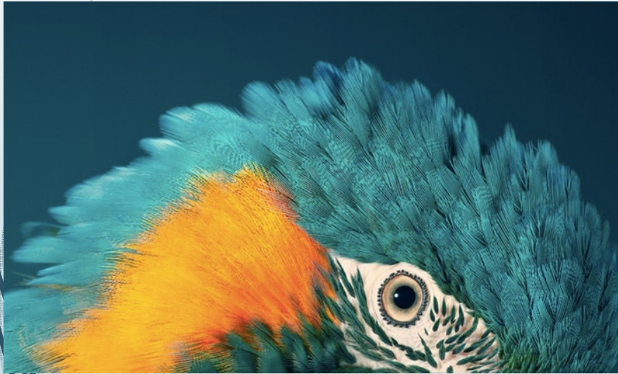
Blue-throated macaws live in Bolivia and are threatened by the illegal pet trade.

Seattle's Museum of Pop Culture is sponsoring a writing contest. Journey to other worlds and explore your wildest imaginations through MoPOP's sci-fi and fantasy short story contest. Details can be found at https://www.mopop.org/programs/programs/write-out-of-this-world/