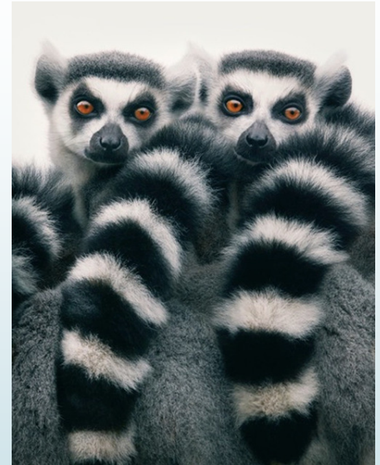
Ring-tailed lemurs are some of Madagascar's most recognizable inhabitants.