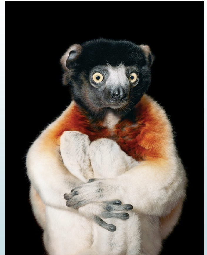
The Crowned Sifka Lemur, like all lemurs, live in Madagascar.

Please clean up after yourselves in the restrooms!